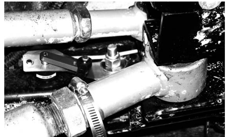
FIGURE 9.2 LEFT REAR SENSOR INSTALLED, NOTE POSITION OF BRACKET AND SENSOR ARM