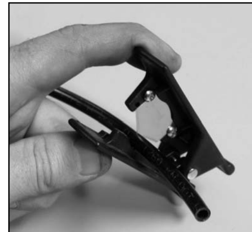
FIGURE 7.2 AIRLINE BEING TRIMMED WITH SUPPLIED TUBING CUTTER