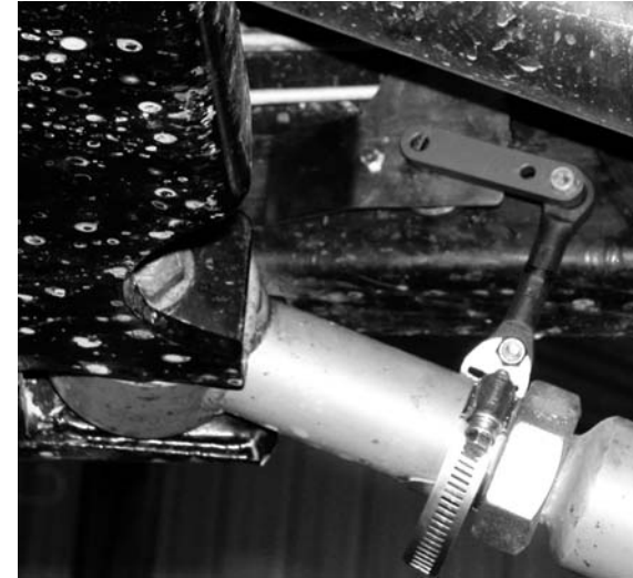
FIGURE 9.1 LEFT FRONT SENSOR INSTALLED, NOTE POSITION OF BRACKET AND ROTATION OF SENSOR ARM

The rear height sensor and bracket will attach in a similar method to the fronts. The difference being that the sensor will be towards the rear of the vehicle once mounted properly and the sensor arm will again be rotated to the front of the vehicle. Attach the sensor link bracket to the control arm as shown. Ensure that the linkage is free from binds and the linkage bracket is mounted next to the jam nut on the lower control arm. On the driverside it may be necessary to unclip the fuel and brakelines and replace them once the sensor is installed.