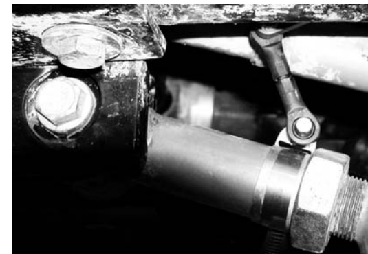
FIGURE 8.3 ROUND CONTROL ARM SHOWN WITH SENSOR LINKAGE MOUNT INSTALLED. NOTE THE LINKAGE BRACKET IS AT THE JAM NUT EDGE.