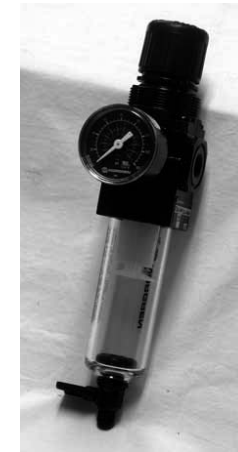
FIGURE 7.1 EXAMPLE OF FILTER/REGULATOR FROM OFFROADONLY

Using the provided tube cutter, trim the airline so that the cut is square to the line itself, to great of an angle will cause a leak. Insert the line into the opening of the fitting. Once a slight resistance is met, a gentle but firm push will result in the line inserting a slight bit further. Give the line a tug, if it is seated properly, the line will not come out. To remove the line, simply push the outer ring of the push fitting towards the fitting while providing a slight pull on the line, once released it will allow the line to be removed. Pulling to hard on the line will not allow it to release. The upper front airspring fitting is down inside the mounting tube. This is difficult to access, but it is possible to install the line and also remove the line without removing the airspring from the bracket. A screwdriver or other tool may be used to reach down in the tube to depress the ring and remove the line.